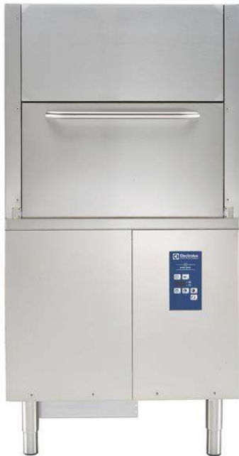
190AQJ (190AQJ) Electric Pot&Pan Washer with electronic control, detergent and rinse aid dispenser - 50Hz - Marine